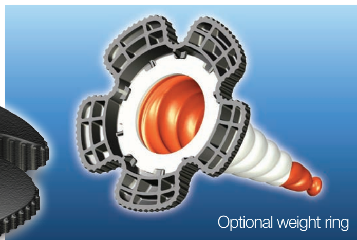
Optional weight ring