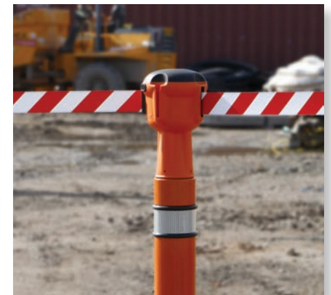
Skipper units simply attach to the post as with a cone