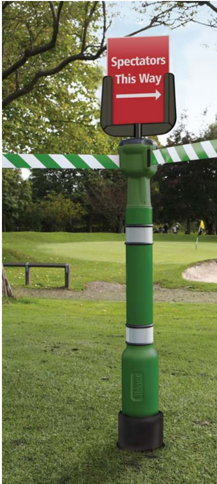
Use the spike to sink the post into the ground