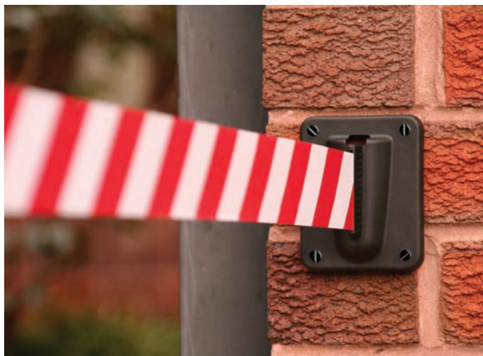
Wall Receiver Clip screwed to a wall