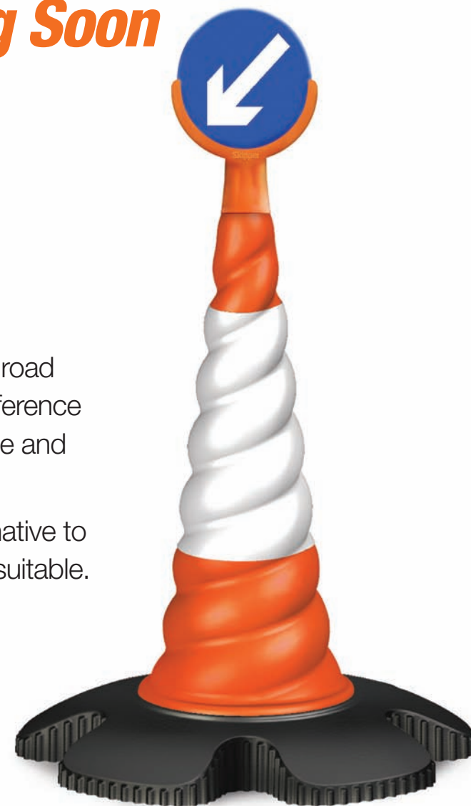
New Skipper road sign on a road cone

The circular design can be used as an alternative to the standard Skipper A4 sign holder where suitable.