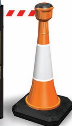
Dumpbins containing 9 Skipper units and a demonstration cone