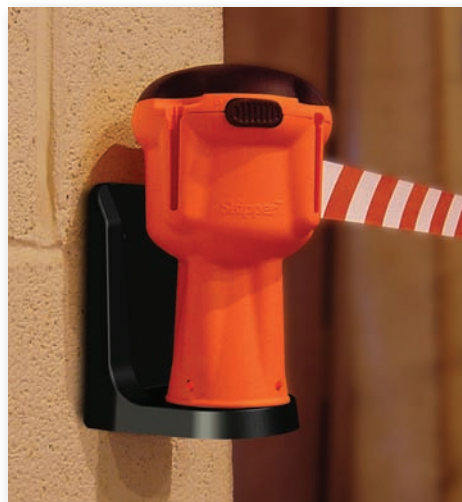
Support Bracket screwed to a wall