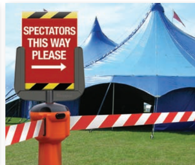
Events & Hospitality