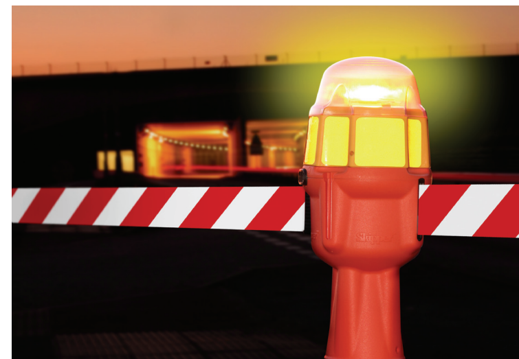
Rechargeable Road Light attached to Skipper