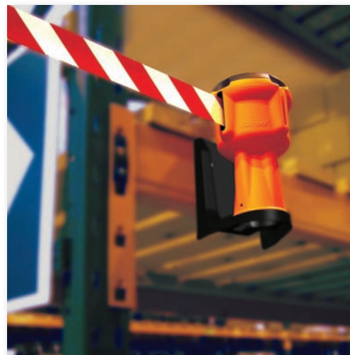
Magnetic Support Bracket attached to a warehouse girder