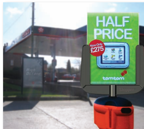
Easy to replace messages