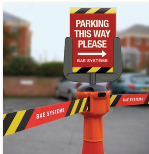
Sign Holder affixed to Skipper Unit