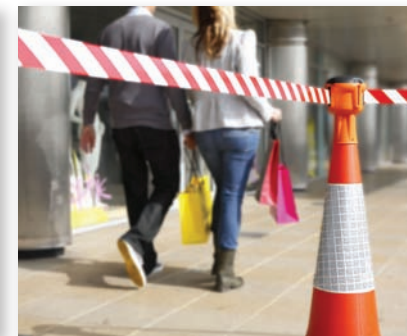
Retail & Maintenance