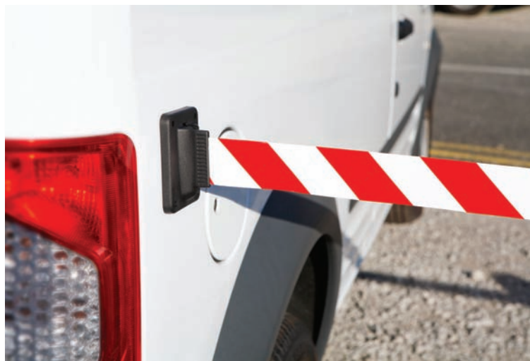
Magnetic Receiver Clip attached to a van