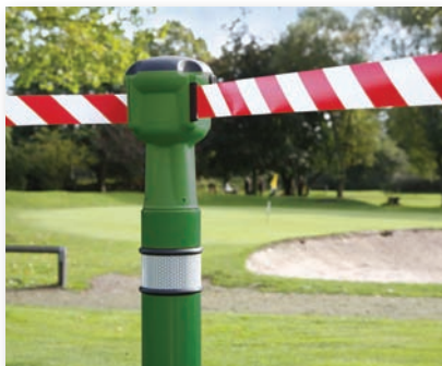
Sports & Leisure Clubs